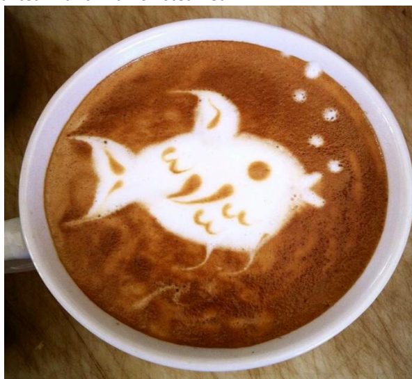
hide out fun with latte art ©2015

Chai Fog Chai tea with cinnamon steamed milk